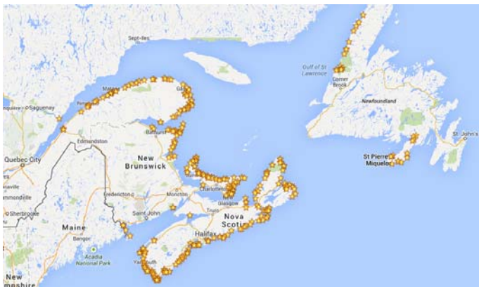
Figure 1 Sites where DFO has distributed materials seeking information on right whale sightings in Atlantic Canada.

An outreach campaign soliciting right whale sighting information from the public in areas outside of the known critical habitat is in its second year. Posters and pamphlets were distributed to over 300 wharves, community bulletin boards, Canadian Coast Guard (CCG) vessels, ferries, whale watch companies and DFO area offices in Prince Edward Island, Nova Scotia, New Brunswick, Quebec, and Newfoundland (see map). Sightings received are entered in DFO's Maritimes Region Cetacean Sightings Database, and shared with the New England Aquarium. To date small numbers of right whale sightings have been received, off Cheticamp and Canso (Cape Breton, Nova Scotia), off Brier Island in the Bay of Fundy, and in the Gulf of Maine.